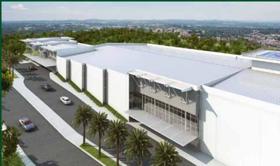
The angle of the view above makes it easier to understand the unevenness of the terrain.

On the other floors, 33 support rooms ensure that any need for subdivision of groups is met.