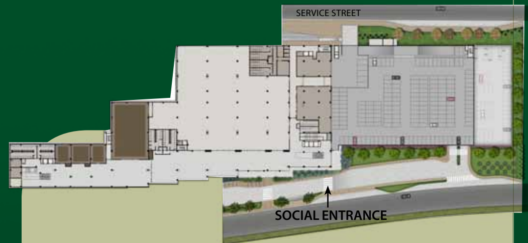
This floor plan of the lower floor shows the guest entrance to the floor, as well as the access to the assembly/disassembly of the exhibition area through the service street.