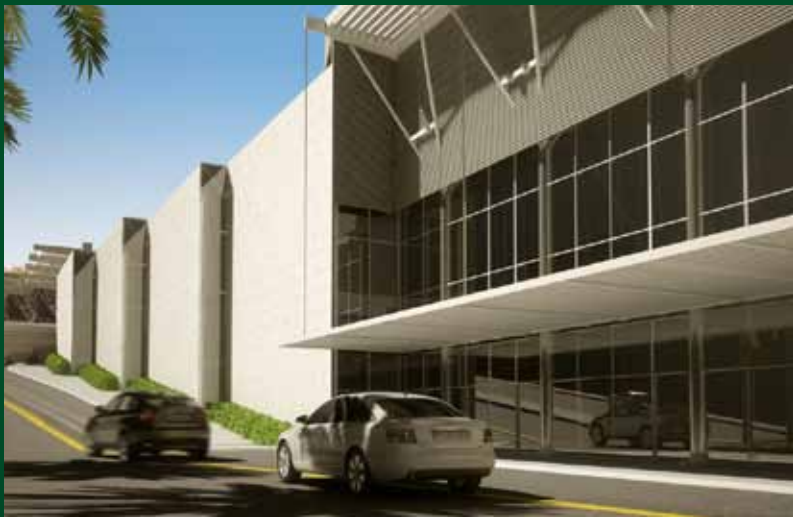
Detail of the guest entrance on the lower level. You can see the entrance to the ground floor on the background.