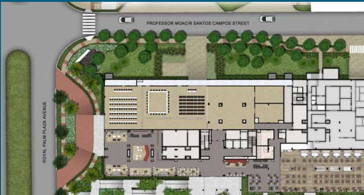
Floor plan of the entire ground floor