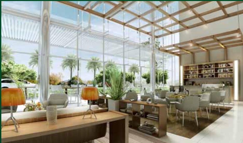
Perspective of the Cafe on the ground floor

A Cafe is also available on the ground floor to ensure maximum comfort to attendees.