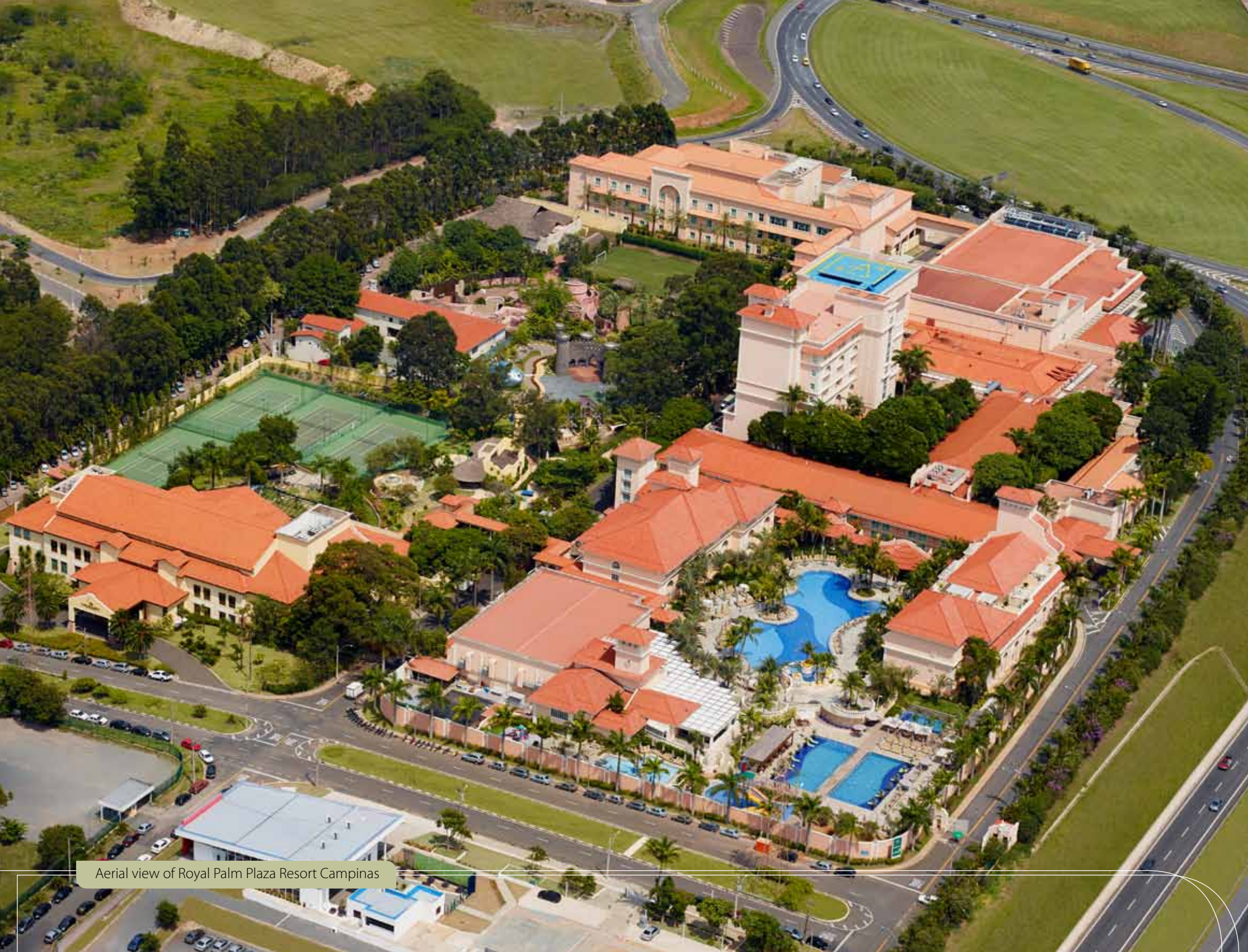
Aerial view of Royal Palm Plaza Resort Campinas