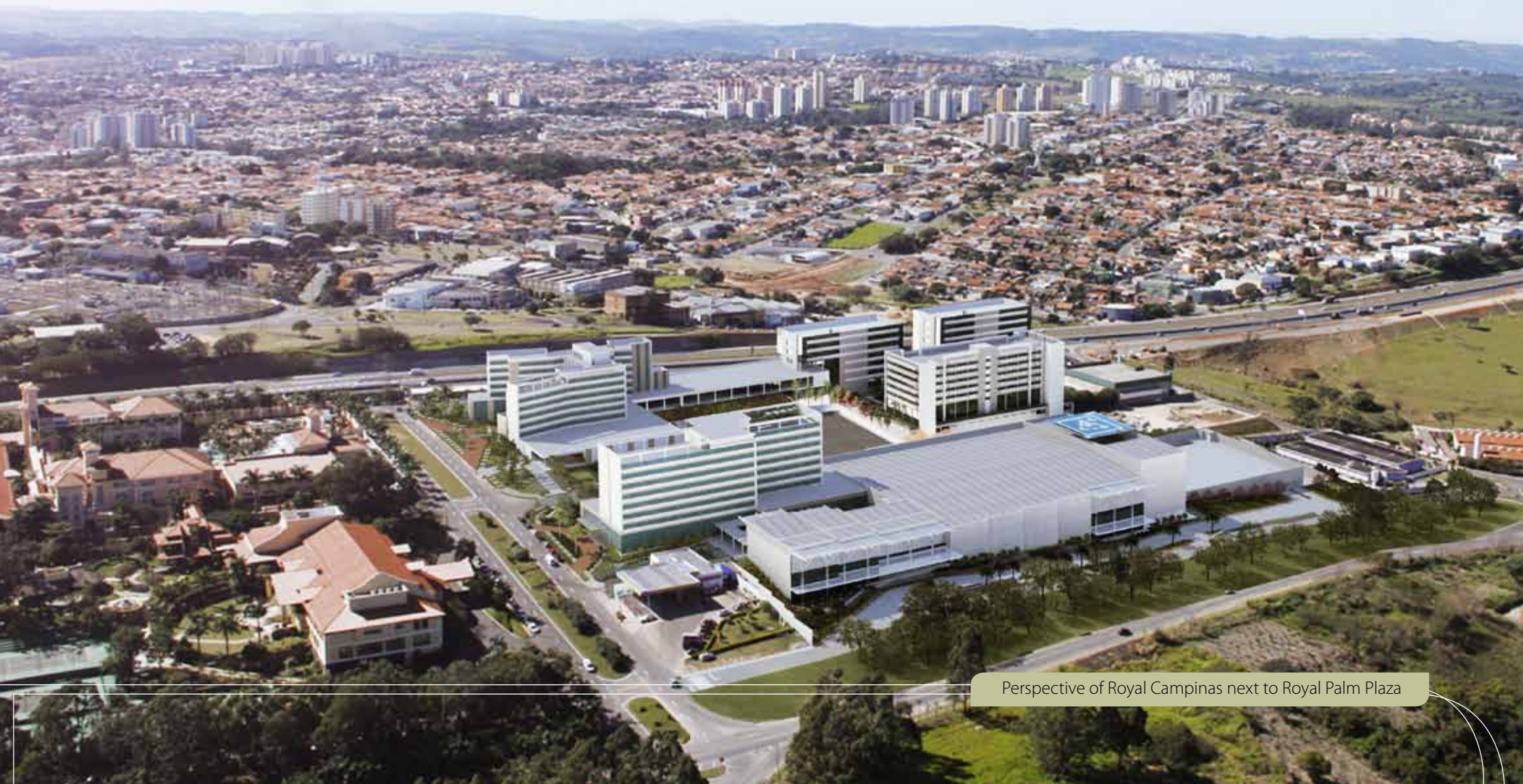
Perspective of Royal Campinas next to Royal Palm Plaza

The vision of creating something unique in Brazil, that could become a milestone in the events market, promoted a partnership between Royal Palm Hotels & Resorts group and Odebrecht Realizações Imobiliárias, through the project Royal Campinas Convention Business & Hotels.