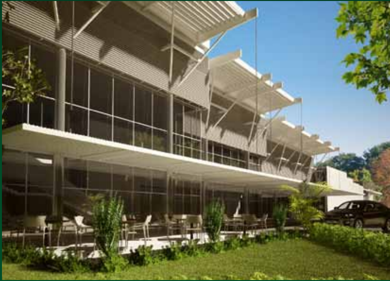
Detail of the guest entrance on the ground floor.