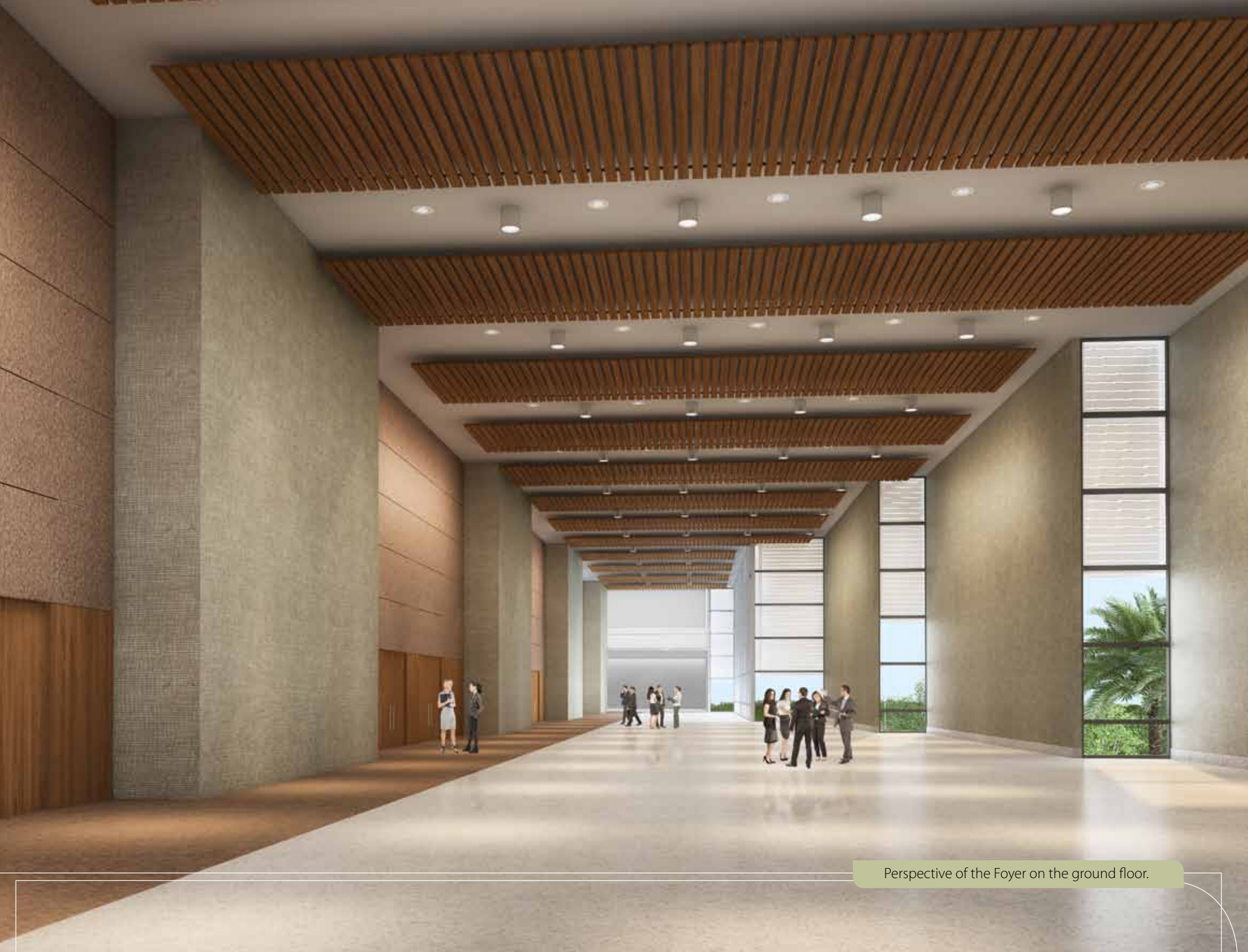
Perspective of the Foyer on the ground floor.