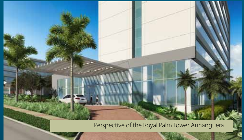
Perspective of the Royal Palm Tower Anhanguera

An important addition to the Royal Palm Hall infrastructure.