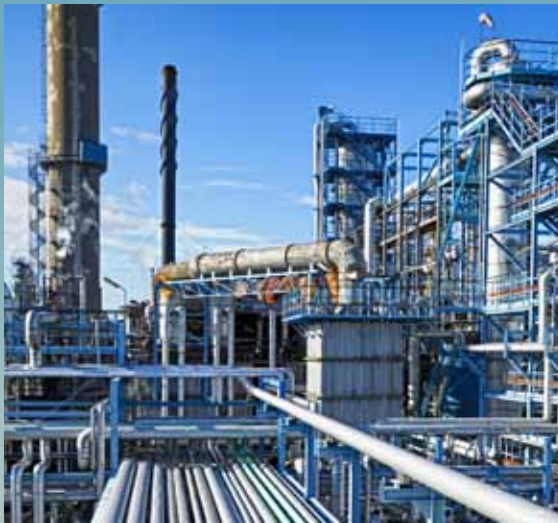
INDUSTRIAL AND CORPORATE CENTER REPLAN, main oil refinery in Brazil, it is an example of the region economic importance. 2

The MRC numbers are impressive: GDP of R$ 110 billion (7.8% of the GDP of the state of São Paulo and 2.91% of the Brazilian GDP) and a population of 2.8 million people. Campinas accounts for R$ 42.7 billion and 1.1 million people. 1