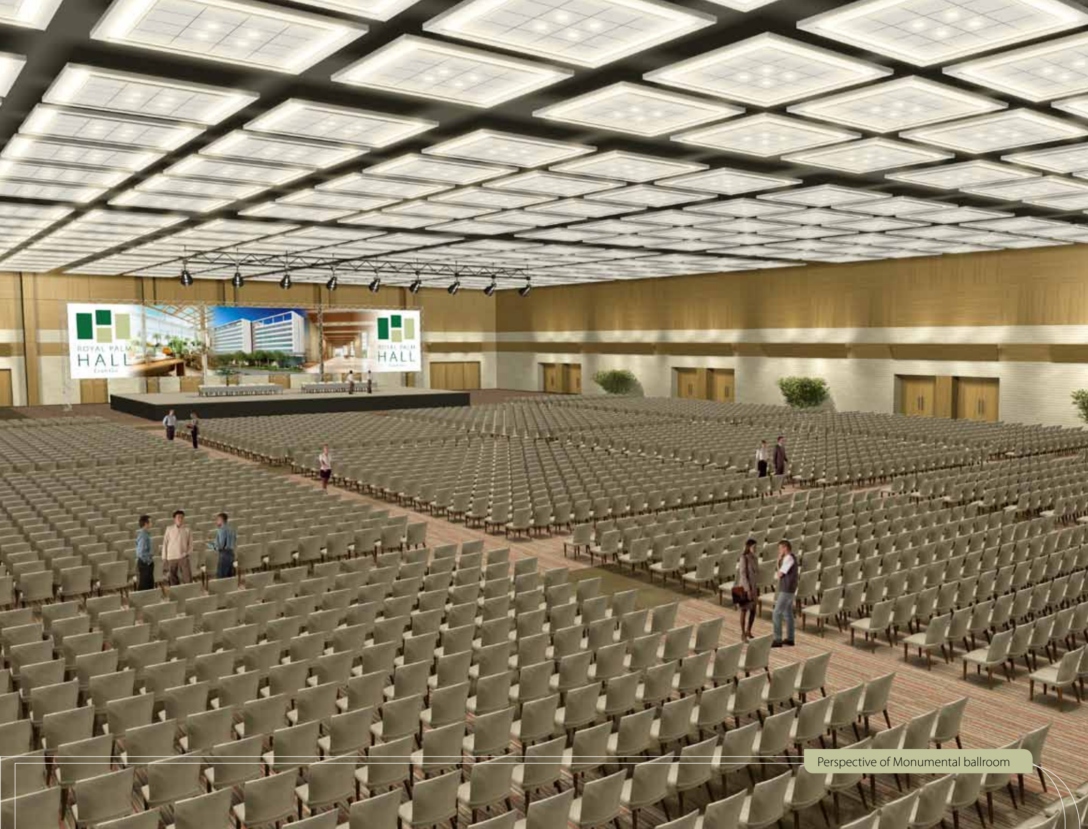
Perspective of Monumental ballroom