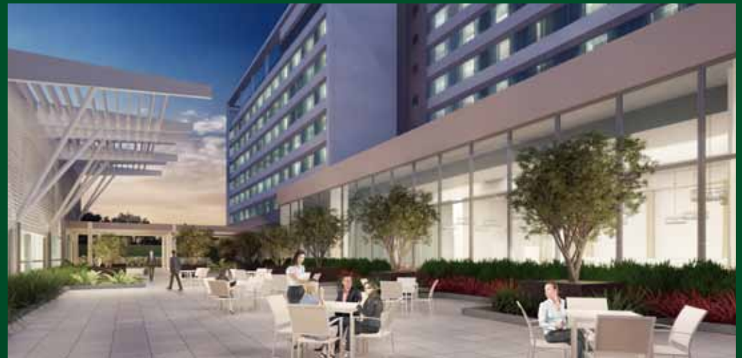
There is also a third guest entrance, but no vehicle access. That entrance promotes the integration of Royal Palm Hall to the other properties.

Even in large events, that will allow the use of separate entrances and the separation of different groups.