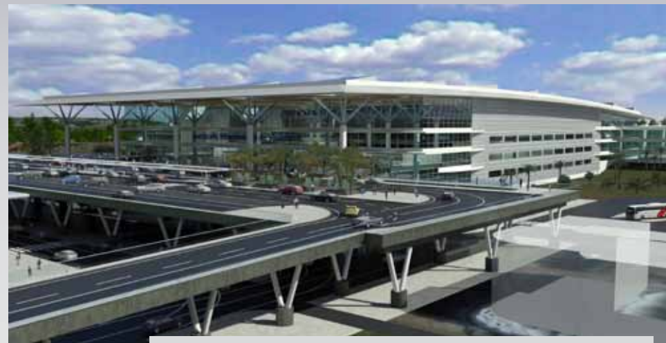
Perspective of Terminal 1