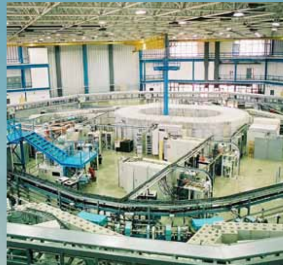
CENTER OF EDUCATION AND TECHNOLOGY with 20 research institutes, including: Embrapa; Instituto Agrônômico de Campinas; Instituto de Tecnologia de Alimentos; Laboratório Nacional de Luz Síncron; Instituto Biológico and CPqD. 3