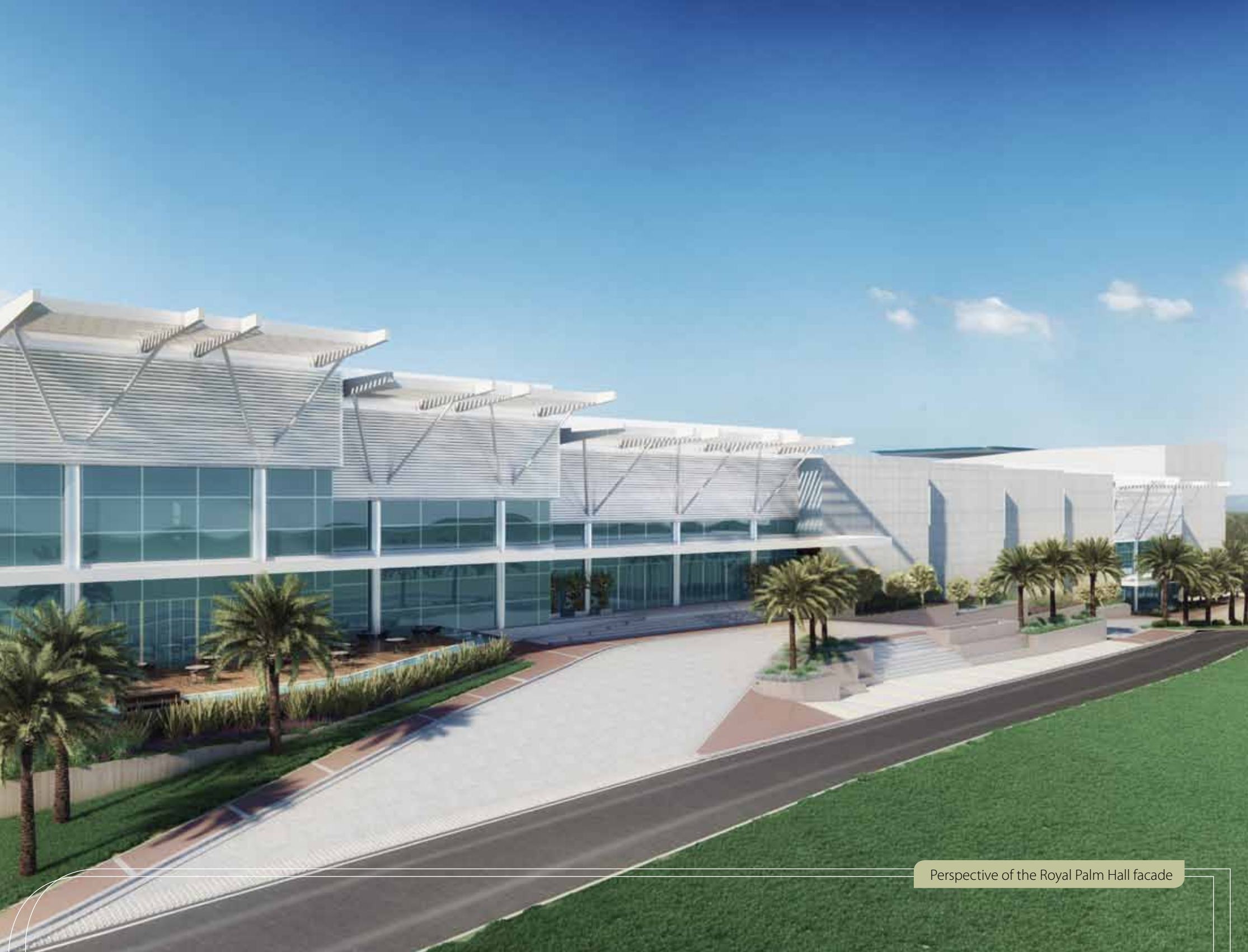
Perspective of the Royal Palm Hall facade