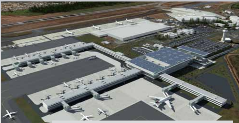
Perspective of Terminal 1